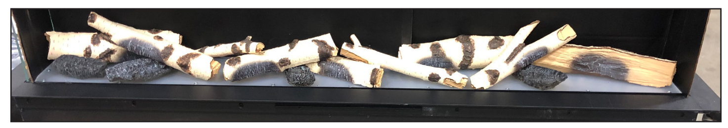
Figure 6. Place Remaining Logs

2. Arrange the remaining logs throughout the firebox so that one end rests on top of another log. Refer to Figure 6 as an example.