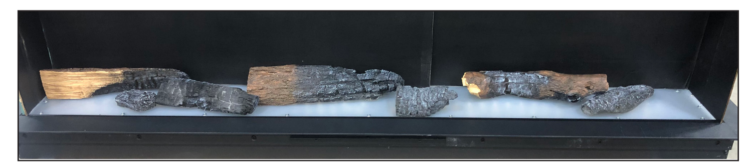
Figure 3. Place Small Logs

1. Take the logs with significant char and position them inside the firebox with the unpainted portion facing down (allowing the fuel bed light to shine through) as shown in Figure 3.