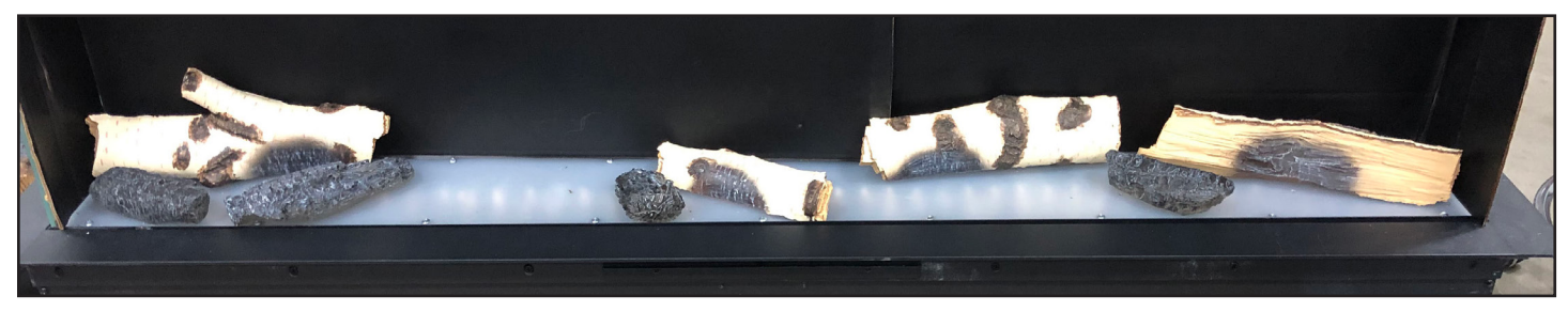
Figure 5. Place Small Logs

1. Take the logs with significant char and position them inside the firebox with the unpainted portion facing down (allowing the fuel bed light to shine through) as shown in Figure 5.