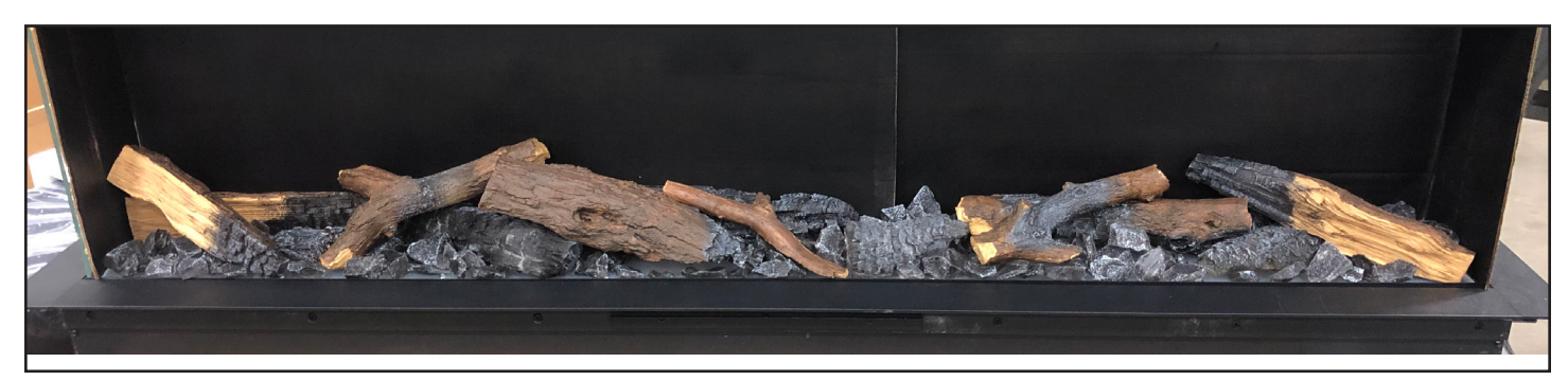
Figure 4. Log Placement Reference per Appliance

3. Evenly place the black or clear finishing embers that came with your appliance throughout the fuel bed, filling in the surface areas between logs. Refer to Figure 4.