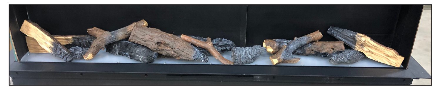
Figure 3. Place Remaining Logs

2. Arrange the remaining logs throughout the firebox so that one end rests on top of another log. Refer to Figure 3 as an example.