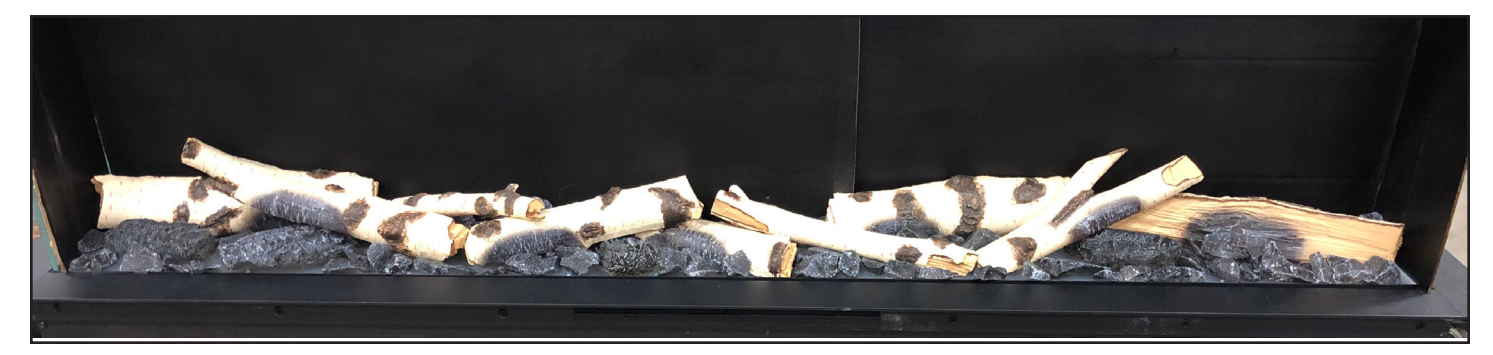
Figure 7. Log Placement Reference per Appliance

3. Evenly place the black or clear finishing embers that came with your appliance throughout the fuel bed, filling in the surface areas between logs. Refer to Figure 7.