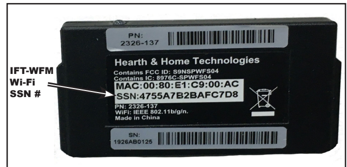
Figure 1 IFT-WFM Wi-Fi SSN # Location

CAUTION! Do not install damaged components. If you received components that are damaged, contact your dealer for assistance.