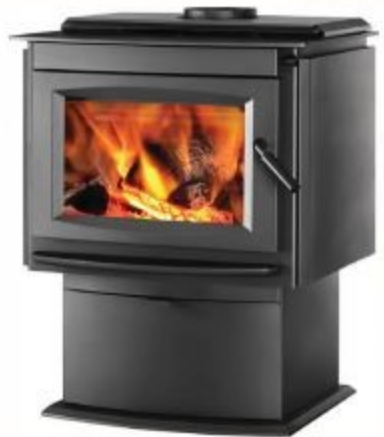
S20-1 with RCHS20