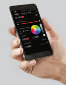
EFIRE ENABLED WITH APP (INCLUDED)