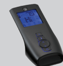
REMOTE CONTROL (INCLUDED)