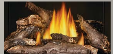
SPLIT OAK LOG SET INCLUDED