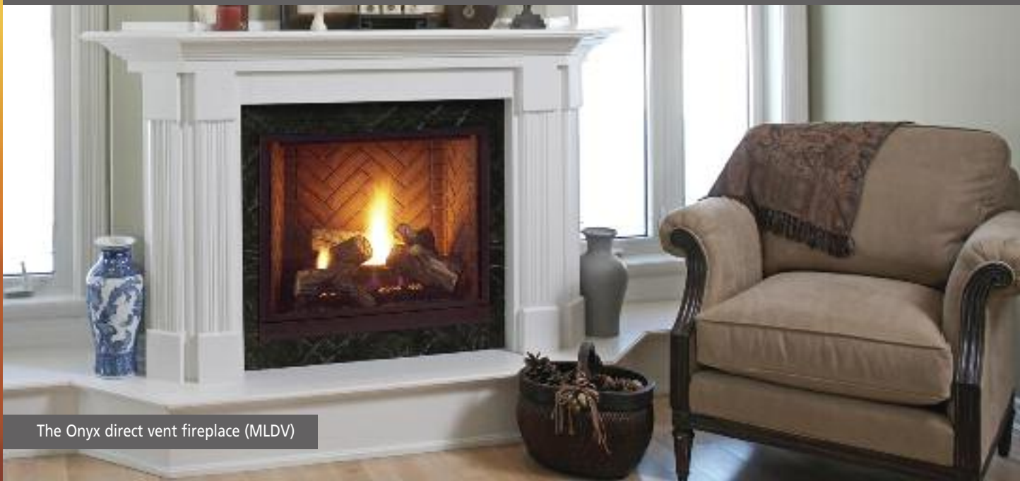
The Onyx direct vent fireplace (MLDV)

Give people a place to gather - make fire the focal point of your room again with these luxury fireplace systems from Majestic.