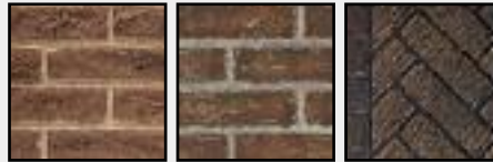
Tavern Brown Cottage Red Olde English for MLDV only