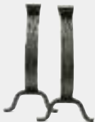
Andirons for MLDV