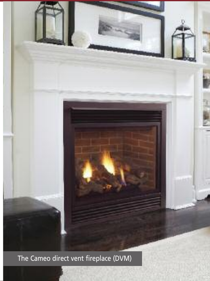
The Cameo direct vent fireplace (DVM)

Choose from multiple trim options, louver finishes, firebrick choices and even multiple decorative front frames or fire screen doors to create your custom look inspired by your home's décor. Bring the ambient warmth of the fire inside: warm up to a Cameo or Onyx direct vent fireplace from Majestic.