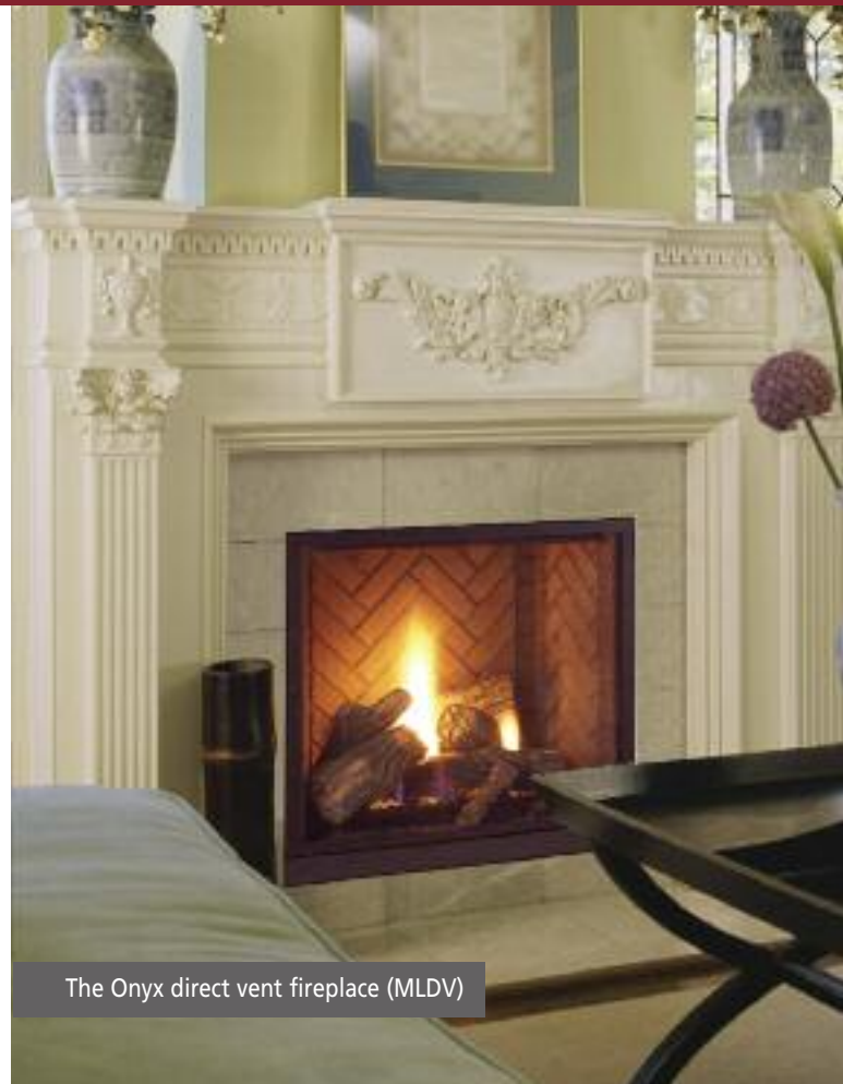
The Onyx direct vent fireplace (MLDV)