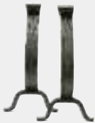
Andirons for MLDV