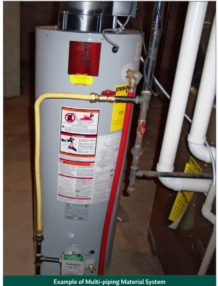
Example of Multi-piping Material System

All new CSST systems must be bonded regardless of whether the systems include only CSST or include other piping materials (steel pipe or copper pipe/tubing) in combination with CSST. Existing non-CSST piping systems must be bonded when CSST is added to the system regardless of the length of CSST added.