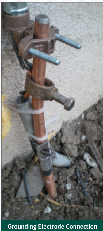
Grounding Electrode Connection

The means for attaching the bonding conductor to the grounding electrode system must be in accordance with NFPA 70.