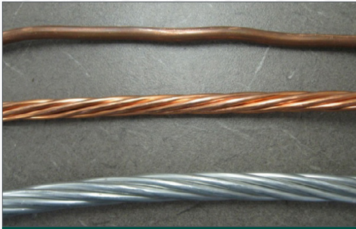
Example of Bonding Conductor

The bonding conductor can be a solid or stranded copper or aluminum conductor. The conductor can be installed indoors or outdoors.