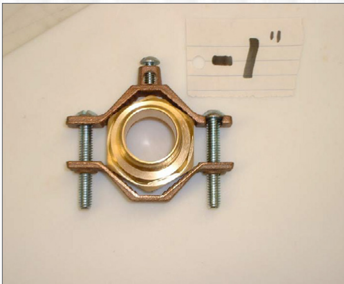
Clamp Attachment on CSST Fitting

Where the clamp is attached to rigid pipe, the pipe surface must be clean and free of paint and coatings to permit a metal-to-metal connection.