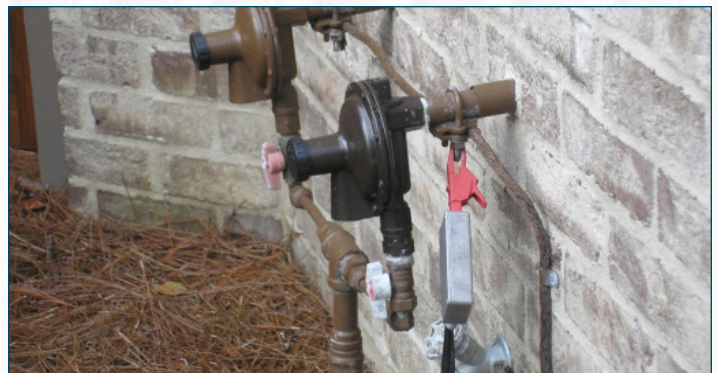
Bonding at the Downstream LP 2nd Stage Regulator

The corrugated stainless steel tubing must never be used as a point of attachment of the bonding clamp.