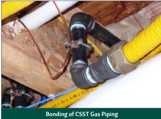
Bonding of CSST Gas Piping

The clamp can be attached to a length of rigid pipe, a malleable iron pipe fitting, a prefabricated manifold, or a brass CSST fitting. The clamp used must be listed for the location and type of mechanical attachment.